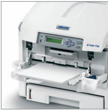
MANUAL FEEDER for flexible media handling