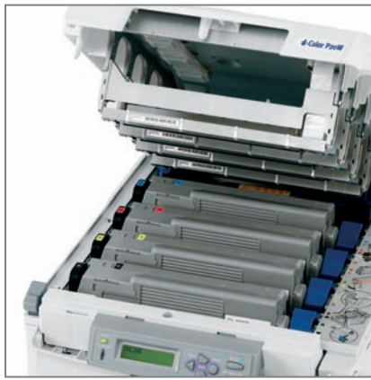
HIGHLY COMPETITIVE COST-PER-PRINT for both colour and black and white