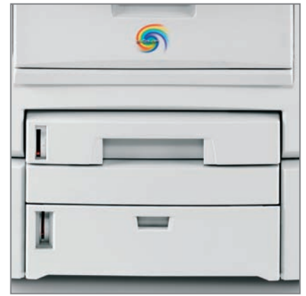
OPTIONAL 2 ND TRAY for 530 Sheets